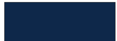
Regal Blue LF09