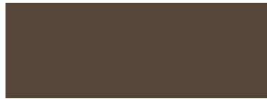
Medium Bronze LF02