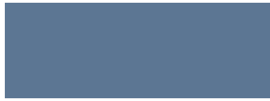
Slate Blue LF01