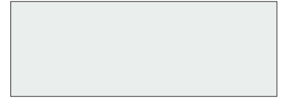
Bone White LF06