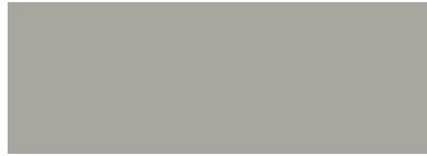
Light Gray LF04